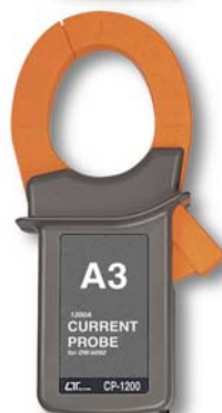
Clamp probess, A1, A2, A3 CP-1200