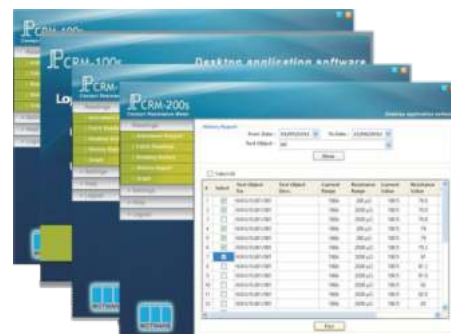
Sample Software Template