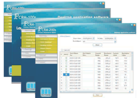
Sample Software Template

Trending of data can reveal vital information about deterioration, the enables user to take informed decision regarding maintenance.