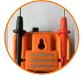
TEST LEAD GRIPPER

TRMS, Auto Ranging, 6000 Counts LCD with Backlight, Torchlight, APO, Capacitance, Frequency, Duty Cycle, NCV (LED, Buzzer & EF Strength), Temperature & Holster with Magnet