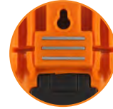
HOLSTER WITH MAGNET